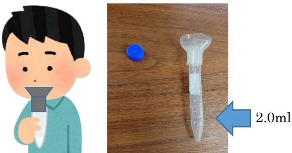
(3) Collection of Saliva